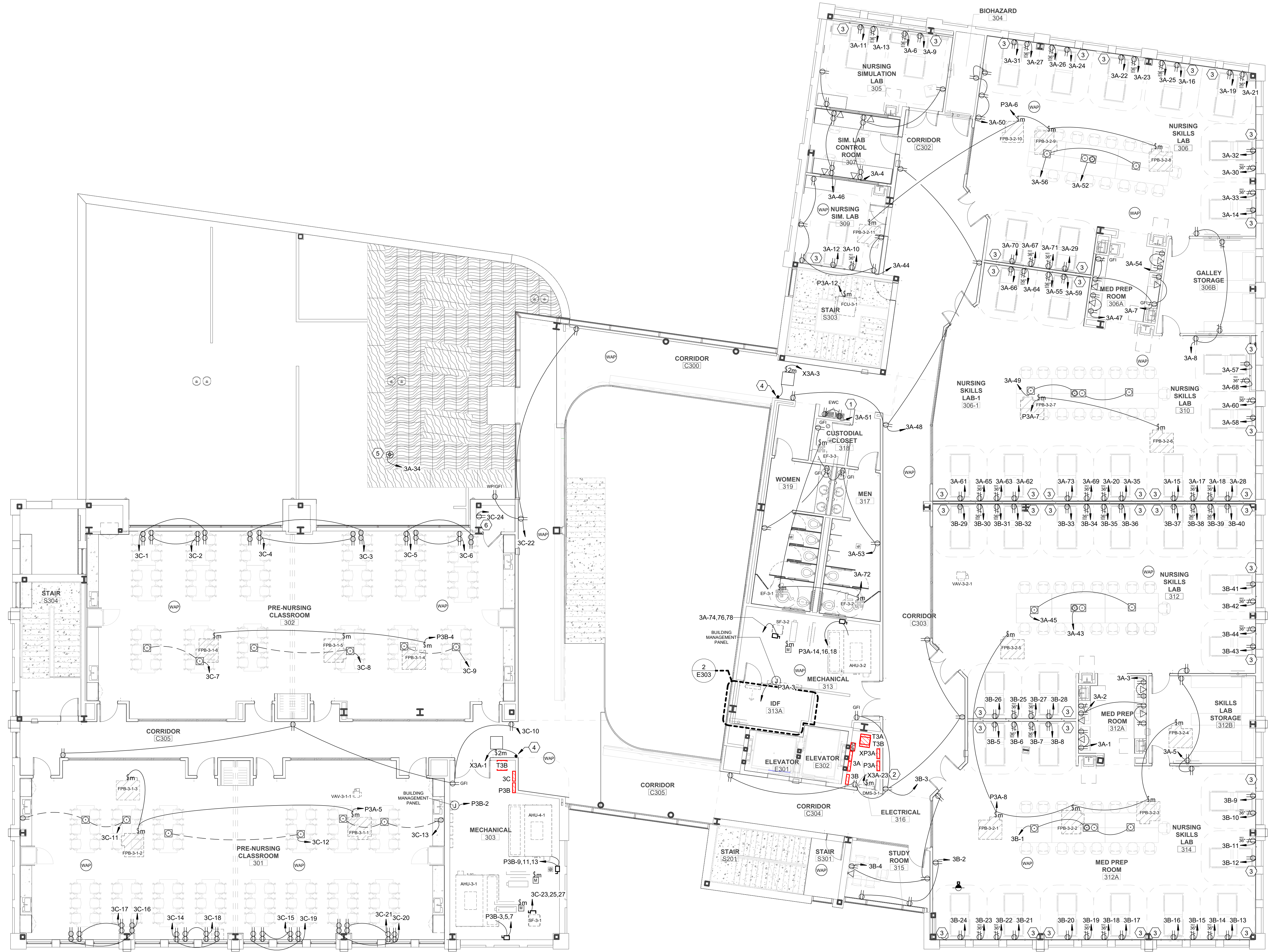
1 3RD FLOOR POWER PLAN 1/8" = 1'-0"