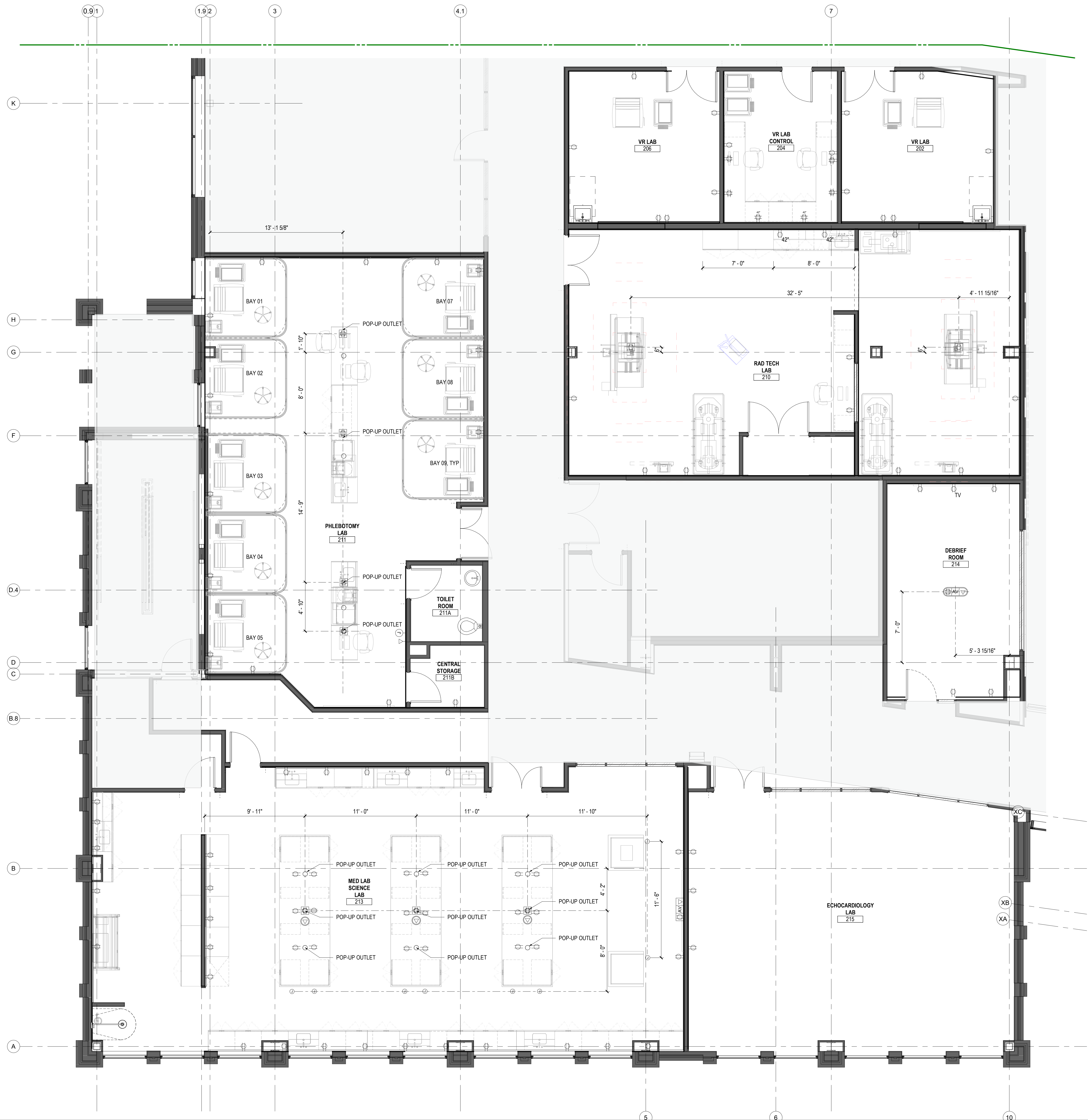
01 POWER AND COMMUNICATION PLAN - AREA A SCALE: 1/4" = 1'-0"