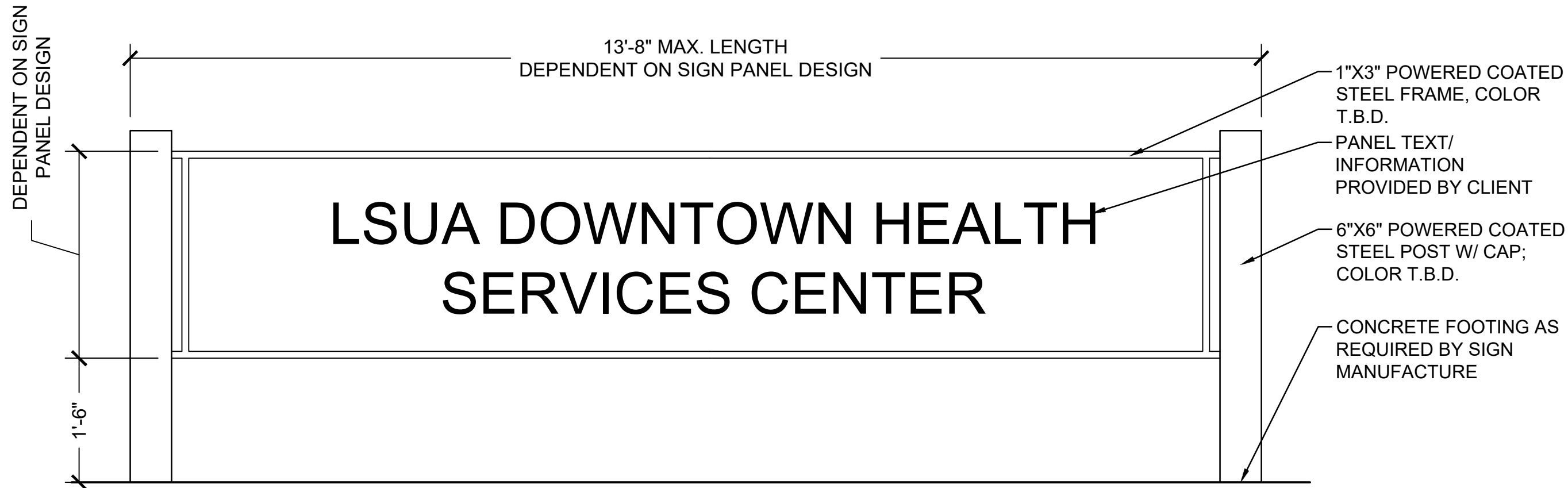
4 MONUMENT SIGN